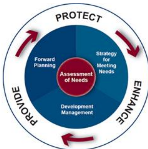
Figure 1: Sport England themes

To provide new playing pitches and ancillary facilities where there is current or future demand to do so